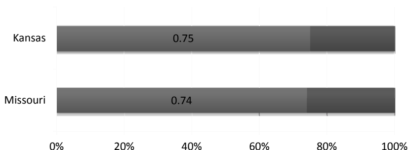
Source: Education Equality Project GRADUATION RATES

"And yet, as many as a quarter of our students aren't even finishing high school." President Obama, 2011